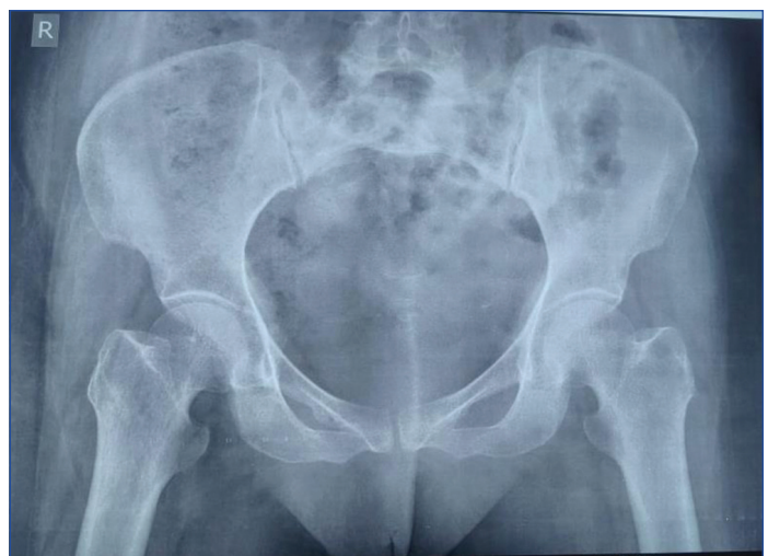
[Table/Fig-6]: X-ray anteroposterior view of the pelvis shows no involvement of the pelvic girdle.