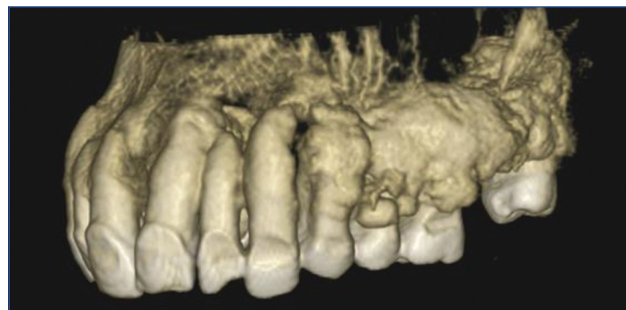
[Table/Fig-3]: 3D view of CBCT maxilla showing hypercementosis (bulbous roots).