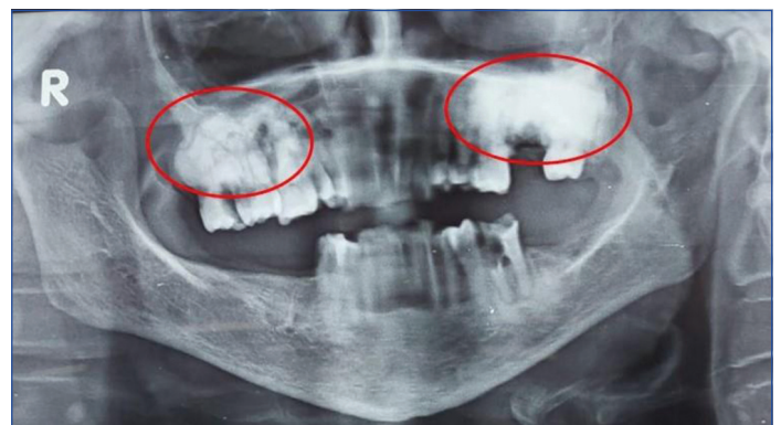
[Table/Fig-2]: Orthopantomogram demonstrating the focal radiopacities with cotton-wool appearance in maxillary right and left molar regions.