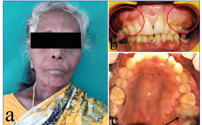
[Table/Fig-1]: a) Extraoral picture demonstrating the facial asymmetry along the left middle third of the face; b) Intraoral images demonstrating the swelling in the right and left posterior maxillary region; c) Unhealed extraction socket in upper left second molar.

The patient was advised to undergo biochemical and radiographic examinations. Biochemical analysis was performed, revealing elevated serum alkaline phosphatase and parathyroid hormone. An orthopantomogram, along with lateral and posteroanterior skull views, was taken. The orthopantomogram showed a well-defined,